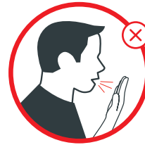
Don't use your hands if sneezing or coughing