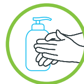
Use an alcohol-based hand sanitiser