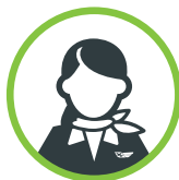
Contact one of our Cabin Crew if you are not well