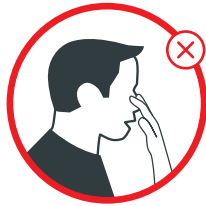
Avoid touching your face