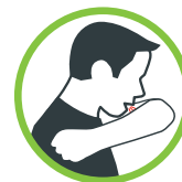
Cover your mouth with a bent elbow when sneezing or coughing