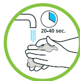
Wash your hands as often as possible